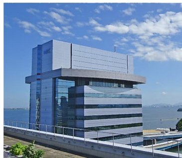
NEC Kyushu System Center