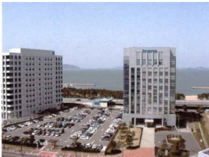
AI Building and Matsushita Electric Kyushu Multimedia Center

Superb Views; The building is located within easy reach of the sea, near the Fukuoka Tower and the Fukuoka Dome. The landscaped area around your workplace is in perfect harmony with nature. As the seasons change you will be able to enjoy beautiful views over the Sea of Genkai