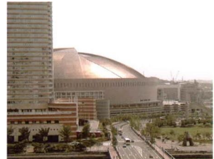
Sea Hawk Hotel & Resorts and Fukuoka Dome

These 3 pictures were taken from the Fukuoka SRP Center Building.