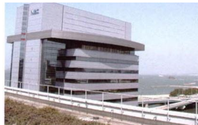
NEC Kyushu System Center